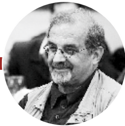
AR. RASEM BADRAN JORDAN Chairperson of Jury